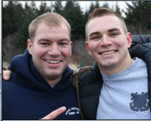
SN Mutchler and SN Staff