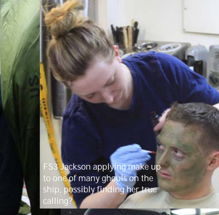
FS3 Jackson applying make up to one of many ghouls on the ship, possibly finding her true calling?