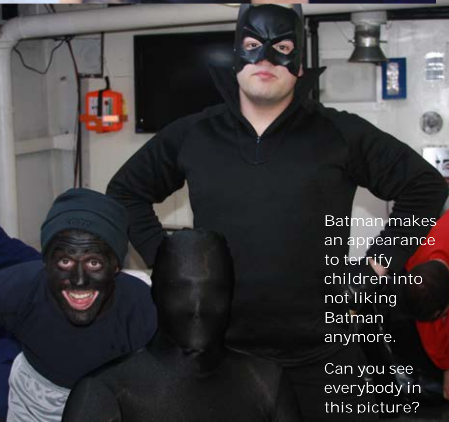
Batman makes an appearance to terrify children into not liking Batman anymore.