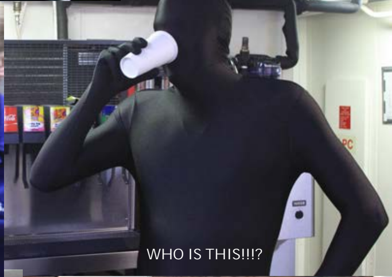
WHO IS THIS!!!?